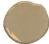
Norwich Brown HC19