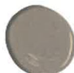
Whitall Brown HC69