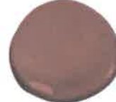
Garison Red HC66