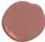
Georgian Brick HC50