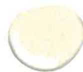
Lancaster Whitewash HC174