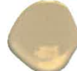
Northhampton Putty HC89