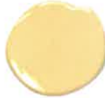
Hawthorne Yellow HC4