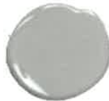
Puritan Gray HC164