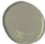
Tate Olive HC112