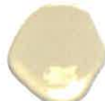
Crown Point Sand HC90