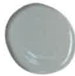
VanCortland Blue HC145