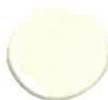
Monterey White HC27