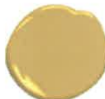
Princeton Gold HC14