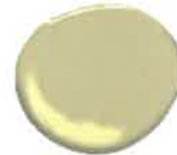
Georgian Green HC115