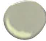
Louisburg Green HC113