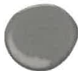
Kendall Charcoal HC166