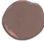
Hadley Red HC65