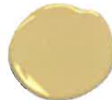
Henderson Buff HC15