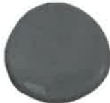
Hale Navy HC154