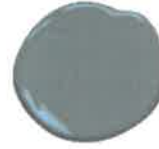
Philipsburg Blue HC159