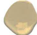
Northhampton Putty HC89