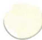
Monterey White HC27