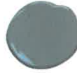
Philipsburg Blue HC159