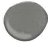
Kendall Charcoal HC166