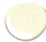
Lancaster Whitewash HC174