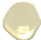
Crown Point Sand HC90