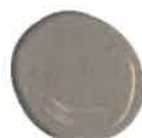
Whitall Brown HC69