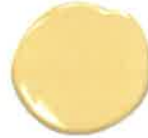
Hawthorne Yellow HC4