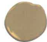
Norwich Brown HC19