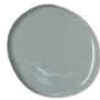
VanCortland Blue HC145