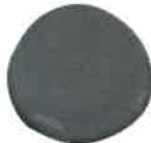
Hale Navy HC154