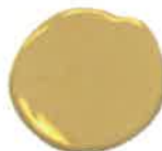
Princeton Gold HC14