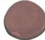
Garison Red HC66