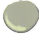
Louisburg Green HC113