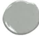
Puritan Gray HC164