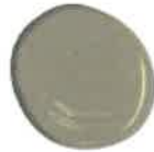
Tate Olive HC112