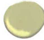
Georgian Green HC115