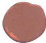
Georgian Brick HC50