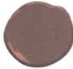
Hadley Red HC65