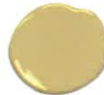
Henderson Buff HC15